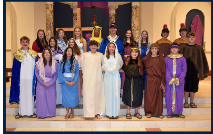
8TH GRADE LIVING STATIONS OF THE CROSS

Don't forget! Progress Reports will go home THIS WEDNESDAY! Please check your child's Wednesday folder for paperwork, and contact the school office if you do not receive your child's report. See the schedule below for this year's volleyball season! Go Lady Falcons! St. Joseph, pray for us.