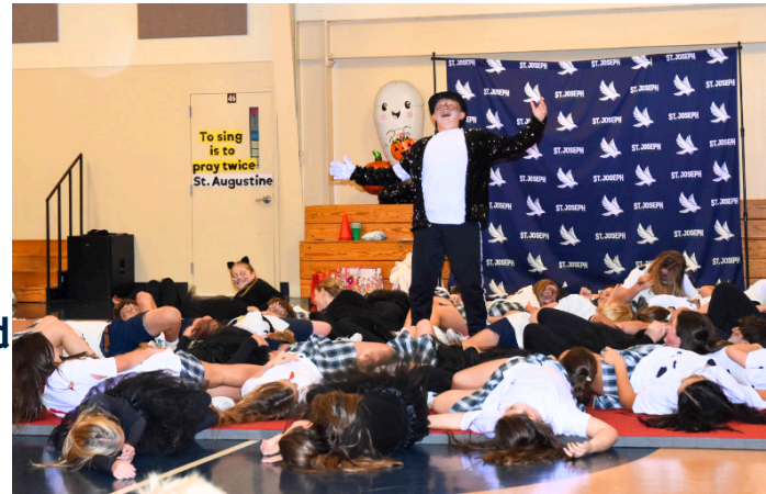
M.S. HALLOWEEN PEP RALLY!

One of the most important ways to continue the legacy of St. Joseph Catholic School is to support the mission through continued charitable giving. Tuition will always have a challenge of covering expenses of a budget to educate over 300 students. What is important is that we strive to fill the gap through fundraising, including expenses that tuition dollars to do not meet. The St. Joseph Catholic School Annual Fund is an important way to support our mission. You will begin to receive information this week regarding the annual giving to this ministry. Prayerfully consider how you may provide support for a great and worthy cause. Saint Joseph, pray for us.