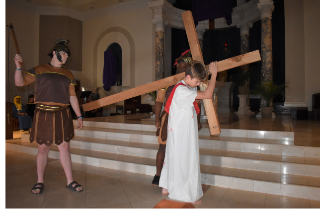
8th grade Living Stations of the Cross

Parents, you are also aware that spring is a time when registration for the upcoming school year opens up. Please continue to register for next year so that we can make the appropriate plans for your child. REMEMBER! Applications for tuition assistance close on Tuesday, April 18th. You can only apply for assistance after you have completed the registration process. If you need any assistance with such matters, please communicate with the school office. We want to make this as simple of a process as possible. Have a great week! St. Joseph, pray for us.